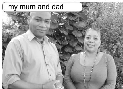
my mum and dad